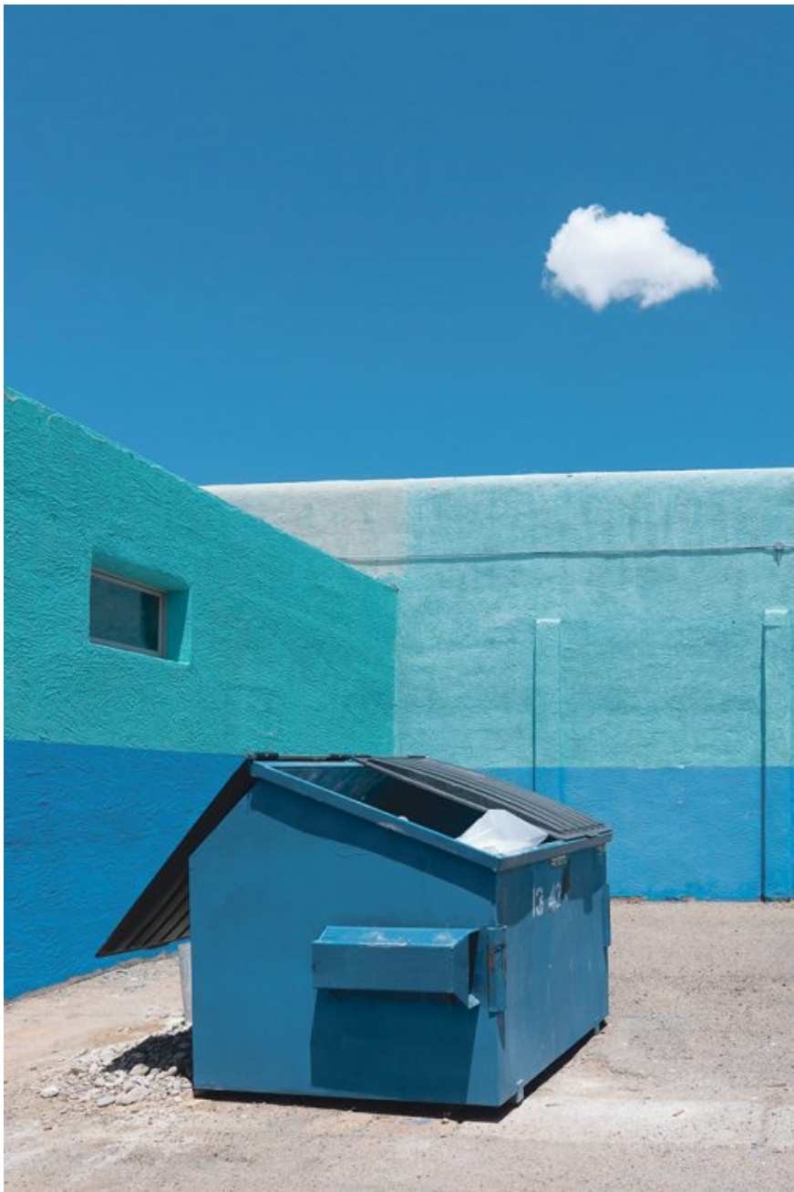
Open to New Ideas