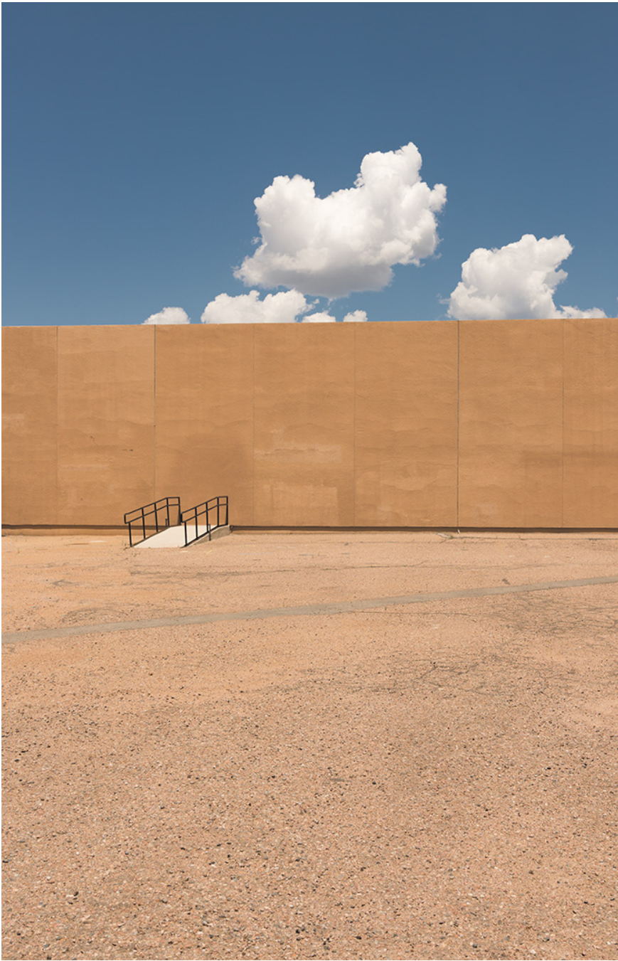
You Can't Get There from Here