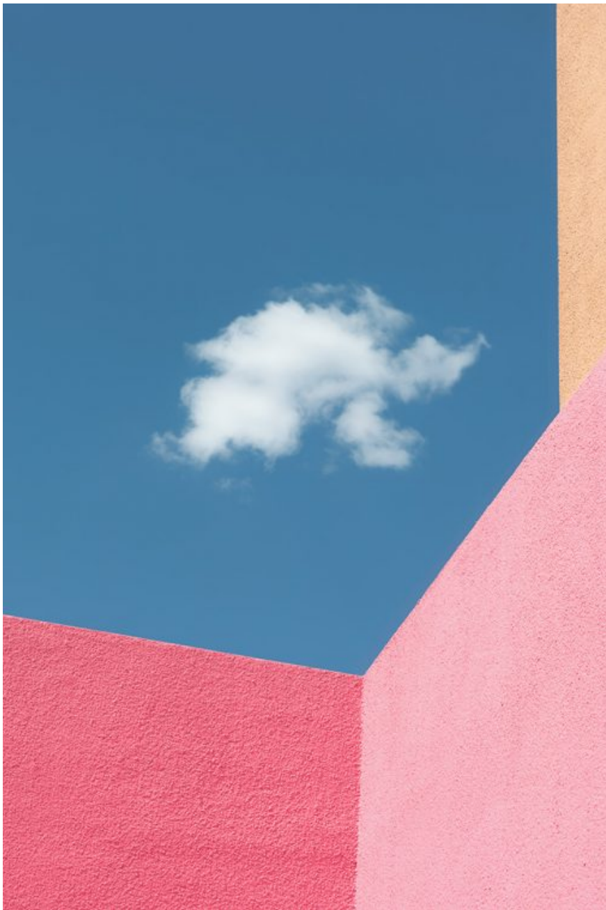
A Good Day (Pink with Cloud)