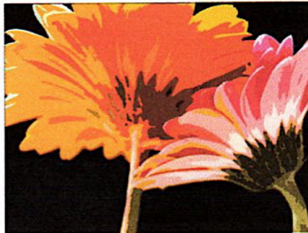
"Miami Bliss" by Alicia Bock

THE STYLE: "I describe my style as abstract-figurative," Tichava says. "My work is often referential to natural forms or has actual drawings from the shadows of plants, trees and grasses. I blend drawings and images from my imagination with studies of objects, as well as patterning inspired by textiles. I also use collaging with metal and paper, which hints at a third dimension on my surfaces."