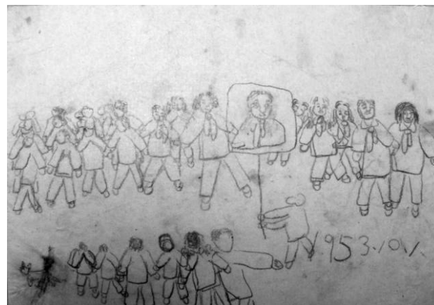
2 Hung Liu, childhood drawing, 1953.

When the Cultural Revolution started, nobody realized the magnitude of it. Then one day, in the People's Daily , which is the party's paper, there was an article criticizing so-and-so—a Peking opera play, you know. We didn't take it seriously. But this opera was about an official in the Ming dynasty who dared to speak out on behalf of the people to the emperor: “People are suffering. It is not right.” Mao Zedong got angry at this. He was always paranoid that the people, especially the intellectuals—writers, musicians, artists—would use metaphors, ancient fables, and folklore to attack the party. That is how it started. We were preparing to enter college, and then school was interrupted, classes