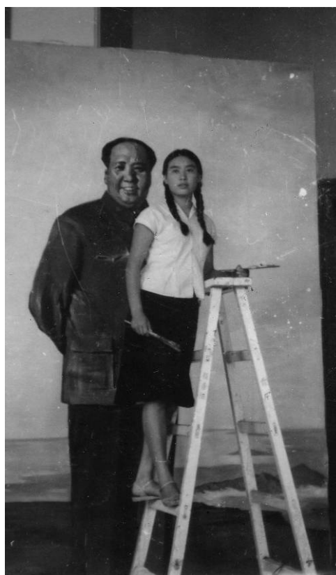
3 Hung Liu poses with brushes in hand in front of a portrait of Chairman Mao created by older students at the Beijing Film Academy, ca. 1966.

I remember that all the Red Guards—the mostly higher-ranking officials’ daughters—got permission to attack the school leaders. The girls all suddenly put on faded soldier uniforms [which they acquired] because a lot of their fathers were older military officials, like People’s Liberation Army (PLA) generals. And the girls’ hair was cut very short or tied up in the air with two rubber bands.