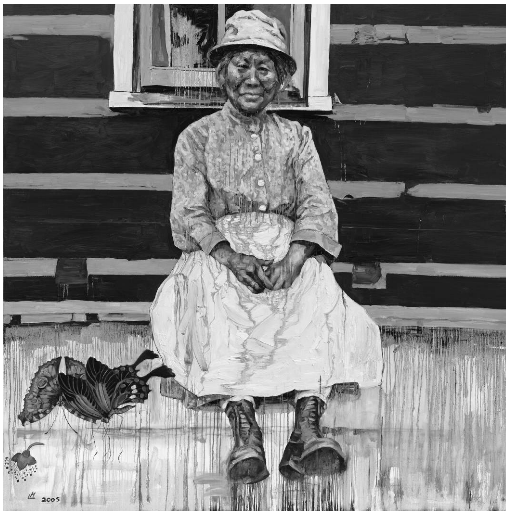
16 Hung Liu, Dangling , 2005. Oil on canvas, 80 x 80 in. Private collection

That's one part of it, a very important part. But deeper down I have also been influenced by revolutionary billboards: if you want get your message across, you have to make an image big and bold. On a physical level, I like to do bigger paintings. The painting you're asking about is obviously a reference to the story of Babylon in the Bible. I felt like Babylon's river is not just on this side of the world. I always remember Byron's poem, "By the Rivers of Babylon, We Sat Down and Wept." I read that poem in Chinese, and it's such a beautiful and melancholy lament about histories we share throughout the world. In this one, it's a refugee who sits by the river. The woman is feeding a little kid some