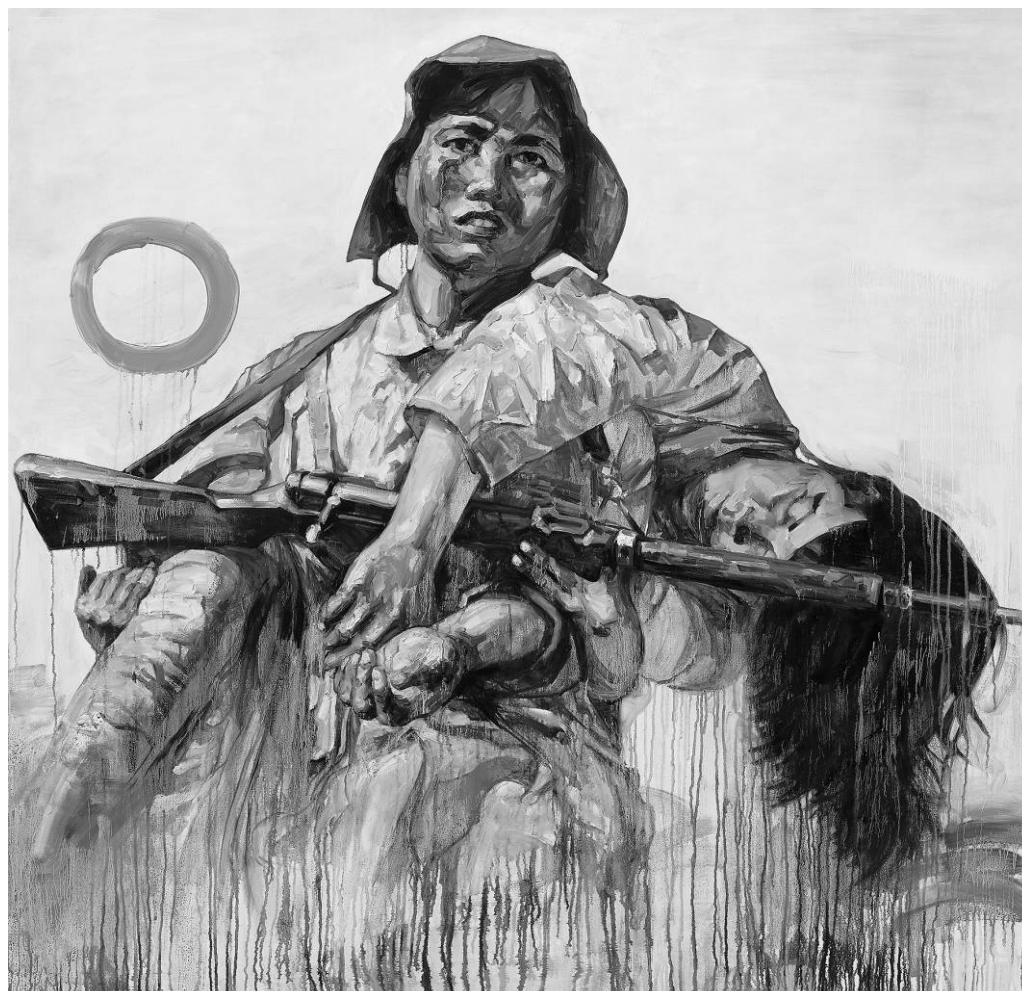
18 Hung Liu, Tis the Final Conflict , 2007. Oil on canvas, 66 x 66 in. Private collection

landscapes. First of all, I had to hide my paint box, which was small. I had to cut my paintbrushes very short to fit into the box, and I attached the gessoed paper on a little board in the box, getting everything ready, tiny paint tubes, pretending to be taking a walk. Sometimes the walks could be twenty minutes, sometimes thirty, and in winter I was all wrapped up in warm clothes and scarves, to sit in the snow. But that was one of my most memorable times, enjoyable, because I was alone and quiet, and there was nothing else but me and nature and nobody telling me what I should and shouldn't do. I just selected whatever was in front of me to paint, facing sometimes just a tree, or an open field, and I started to work. That