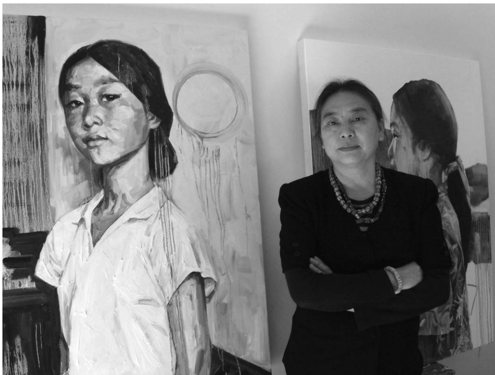
1 Hung Liu in her Oakland, California, studio with paintings, 2010.

where she remains on the faculty. In 1991 she became an American citizen and returned to China for the first time. She has maintained close ties to China through visits, friends, fellow artists, and daily telephone calls to her mother until her mother's death in September 2010.