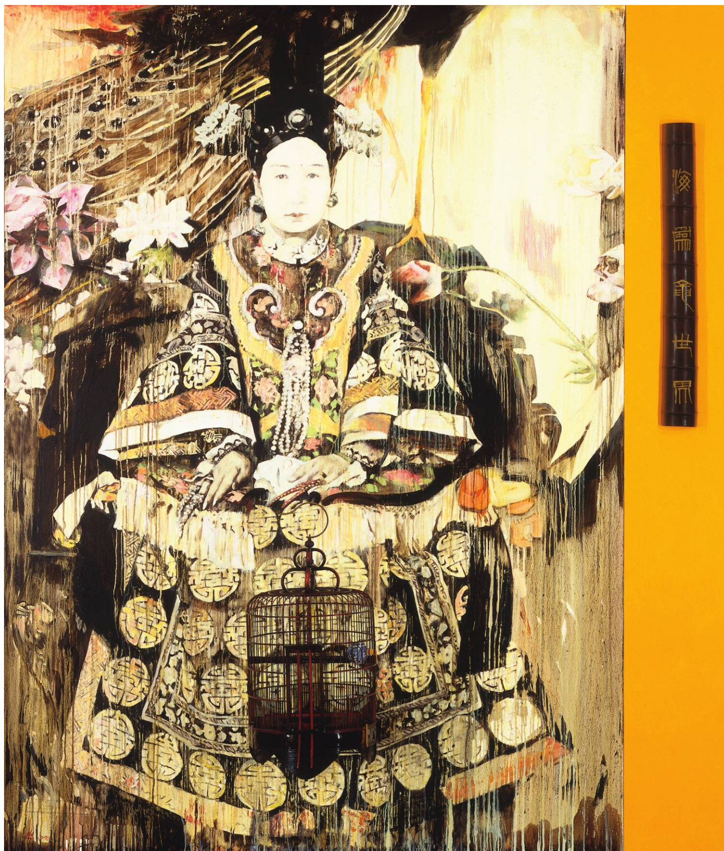
Hung Liu, The Ocean is the Dragon's World , 1995. Oil on canvas, painted wood panel, metal support rod, and metal birdcage with wood and ceramic appendages, 97 x 82½ x 17⅞ in. Smithsonian American Art Museum, Museum purchase in part through the Lichtenberg Family Foundation