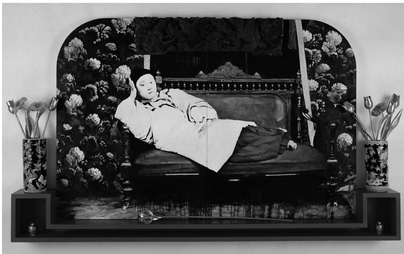
12 Hung Liu, Odalisque , 1992. Antique architectural panel, lacquered and painted wood, ceramics, 52 x 95 x 8 in. Private collection

first time. I got a faculty research grant and went to Beijing to try to find more historic photographs that survived the Cultural Revolution. I went to a Beijing film archive and asked for “anything old.” They brought out cardboard boxes with loose photos and some that were mounted and captioned in Japanese. I looked at the titles of the photographs and one said it was a famous prostitute in China. The first time I saw those kind of photographs, they were so bizarre, with the prostitutes placed against a photo studio backdrop—even the Eiffel Tower—with various props or European accoutrements, like bicycles, organs, telephones, and there were even two prostitutes sitting in an airplane. I took photographs of every page I came across. It seemed like a very exclusive, elite list of young women, some kind of small group for clients. I turned the pages