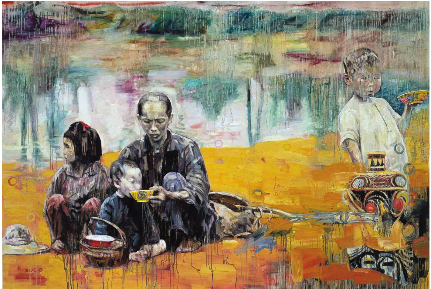
15 Hung Liu, By the Rivers of Babylon , 2000. Oil on canvas, 78 x 114 in. Private collection

is not in the picture. They're walking in the shallow water on the rocks and the mother is leading the way. It's a big painting, almost life-size. When I was painting it, I realized the gap between the generations, but also the ties that bind them. The riverbank, the water, are very abstract actually. I used more and more washes, and the paint just drips over. It's like when you return to photographs and memory, sometimes you try so hard to focus that it's impossible to focus sharply. So this painting opened up the space for me, and a lot of the space I deal with actually rather abstractly. I like the simplicity and the symbolism of it. When I was painting this in the old studio in Oakland, my mom visited me. I said, "Mom, it's like us."