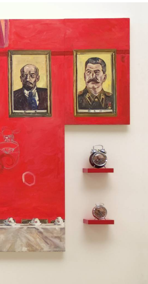
17 Hung Liu, Modern Time , 2005. Oil on canvas, lacquered wood, Cultural Revolution clocks, 66 x 168 in.