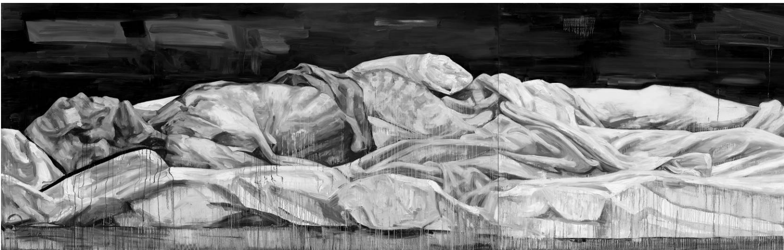
19 Hung Liu, Holy Saturday , 2010. Oil on canvas, 60 x 240 in.

Lately I've been working from things I have observed firsthand instead of from historic photographs. For example, a woman who was teaching an anatomy class invited me to visit a lab where medical students study cadavers. I visited, observing the dead, and took some pictures during my visit. So in a sense these paintings still come from photographs, but the difference now is that these are my own photographs of dead things that came into my life. For example, my husband and I took a walk near our house in Oakland and came upon a dead deer hit by a car. It was a doe, and I took pictures with my phone. Several months later, I came upon a dead fawn at almost the same