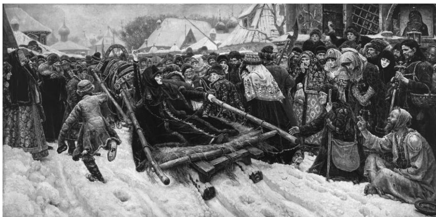
7 Vasily Surikov, The Boyarinya Morozova , 1887. Oil on canvas, 9 ft. 11 11 / 16 in. x 19 ft. 3 5 / 16 in. The State Tretyakov Gallery, Moscow

I worked in the field for almost four years, and then school reopened. But they only would take students from Gong Nong Bin —workers, peasants, and soldiers, considered the leading classes in China. I was in the countryside, so even though I was not from a peasant family, I was a peasant myself then. It just so happened that Beijing Teachers College had a professor looking for new worker, peasant, and soldier students in our area, and I met him. I think he was a Chinese literature teacher. I said, "Do you have anything in art? I would really love art," and I even probably showed him some sketches. He said, "Let me go back and ask." It was like a miracle. For the whole county, a really big county, they added one position to accept an art student. I went through some hoops, but I got in. And I remember on a very dusty country road before he got on the bus, he said to me, "I hope you study hard and you get in. Also, make sure"—I was already twenty-four—"make sure, during your time at college, you are not allowed to have a relationship," meaning don't get involved with boyfriends and only concentrate on your work. I said, "I can guarantee you this; this is so precious, such a unique opportunity. I will work hard and follow the rules." I never saw him again. And then I went to this—it was not an art department,