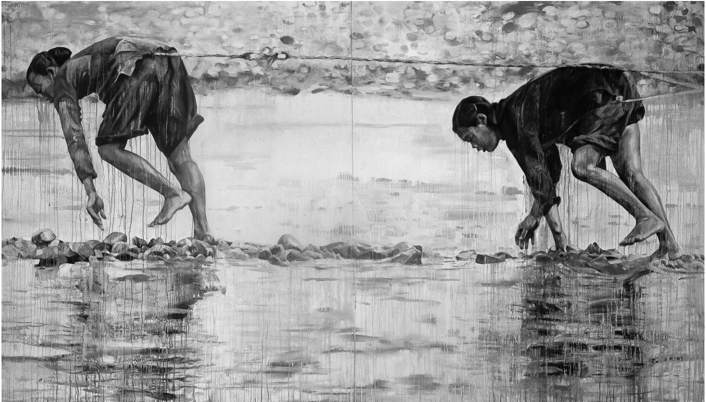
14 Hung Liu, Mu Nu (Mother and Daughter) , 1997. Oil on canvas, 80 x 140 in. Kemper Museum of Contemporary Art, Kansas City, Missouri, Museum Purchase

an opulent gown. Against the backdrop of a peacock and a lot of decorative components surrounding her, her face almost disappeared. I emphasized her robe, her jewelry, her backdrop, even her jade fingernails. But her face I did very lightly, very pale, and it feels overall like her face is less important than the symbolism of her power. And I attached the two couplets on the side panel. When this painting was bought by the National Museum of American Art [now the Smithsonian American Art Museum], I realized that they had another portrait of the Dowager Cixi in the same collection, done by Katharine Carl, an American woman painter, in 1903. Katharine Carl had to change her painting according to the empress's taste, so she made a painting almost like a puppet. I saw the photograph of this painting. Her face is smooth, like a little porcelain doll—young and spotless and everything tightly painted. In my much