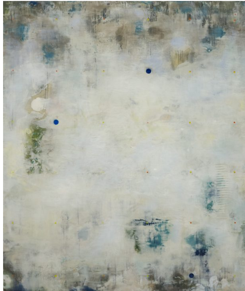
Dust Stories (2012), encaustic on panel, 60 by 50 inches

what determines her work’s radiance and mystery lies in her process. The artist started working in encaustic before the medium became as widespread as it is now, and in her studio she takes me through some of the steps that lead to the finished work. She begins with large birch panels—“often in the color red, the color of our insides because I work from the inside out, from flesh to spirit,” she explains. “Then I need to obliterate it, unifying with whites.” She spreads layers of encaustic—in her case, a mix of damar resin and beeswax—and