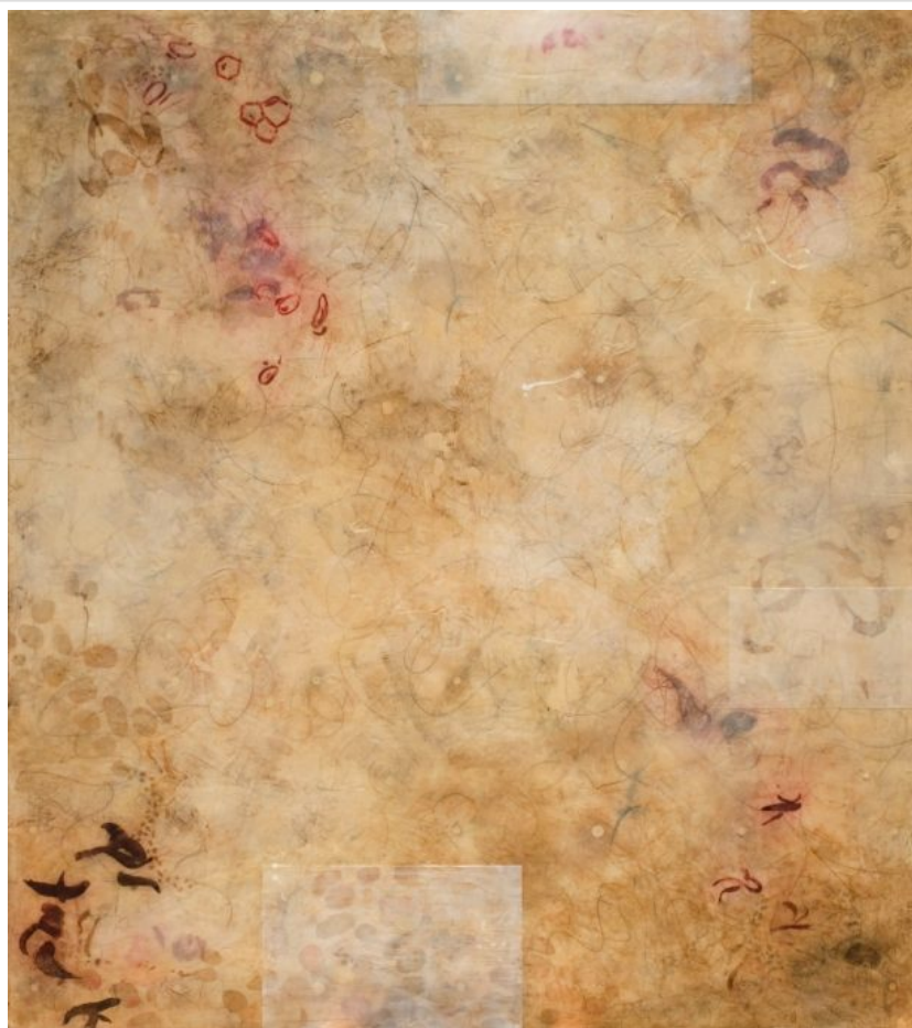
Dissected Desire (from the "Lumens" series, 1999), encaustic on panel, 78 by 69 inches