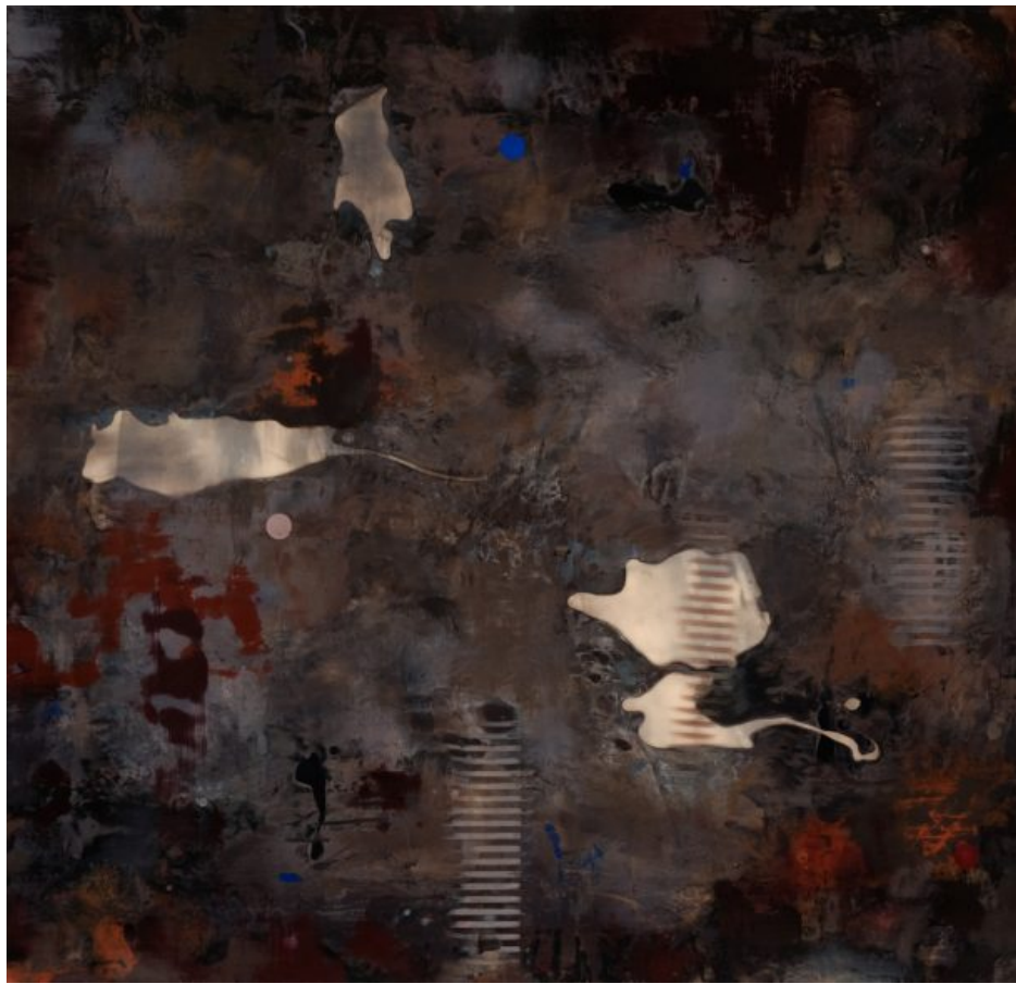
Gravitas (2013), encaustic on panel, 40 by 38 inches