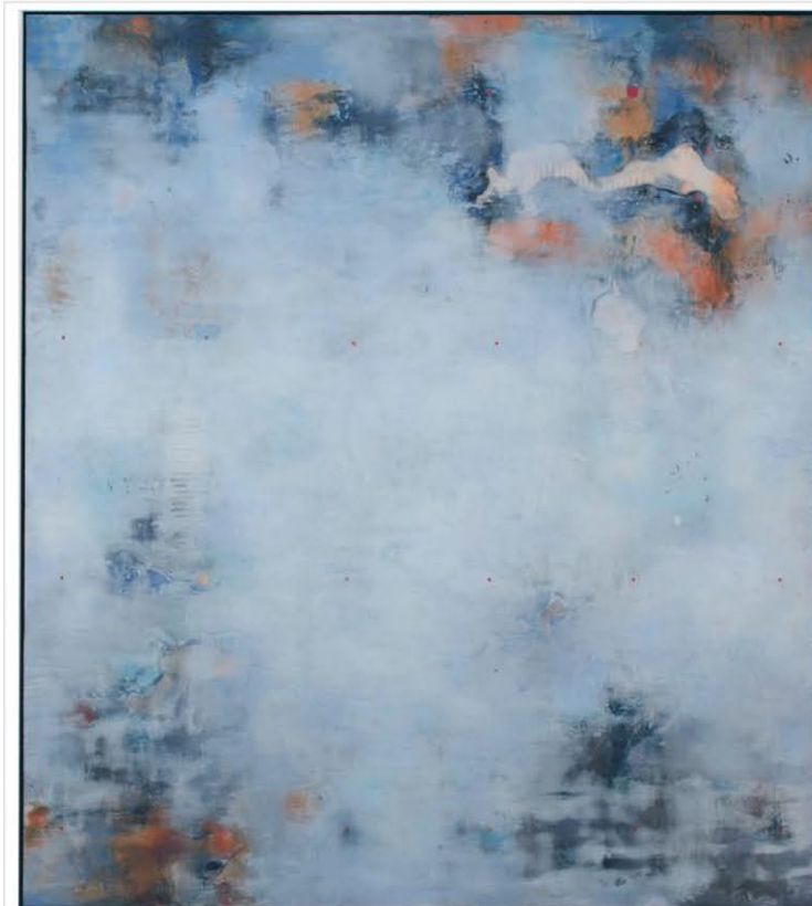
Zuiderzee (2013), 72 by 64 inches