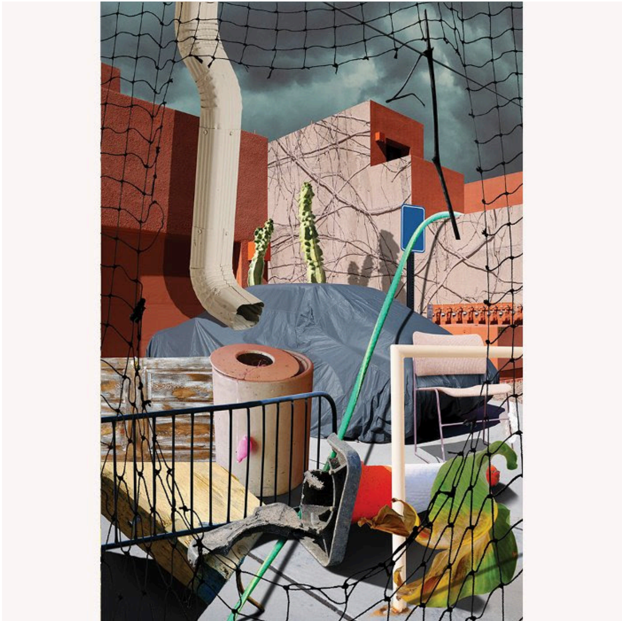
Natalie Christensen and Jim Eyre, Spread , 2021, photo collage, archival pigment print on photo paper mounted on dibond with UV laminate, 40 x 27" unframed, Edition 1/2